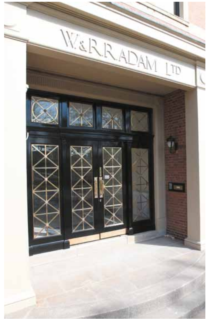
● Elegant and historic.