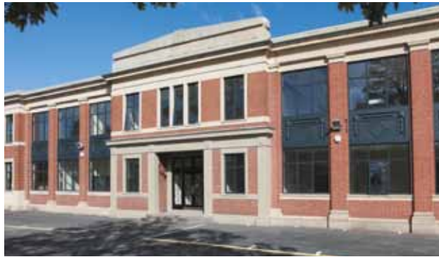
● Adam House, newly refurbished.

Over the next few weeks, the district's largest and oldest legal firm will up sticks from their current Worcester Street home and complete their move across town to Adam House, the imposing red-brick building on Kidderminster's Birmingham Road – once